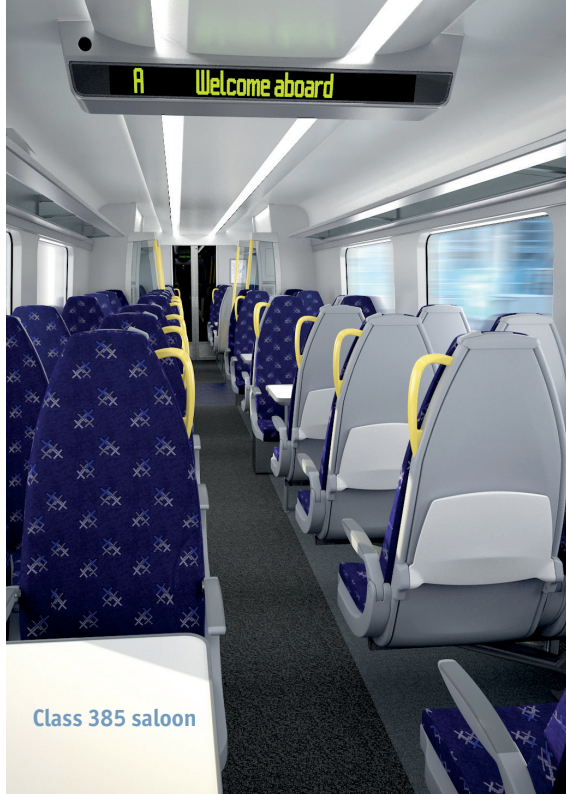
Class 385 saloon

Other options: Two trains per hour go via Shotts to Glasgow Central taking between 1hr 18 & 1hr 31. And one train every two hours links Edinburgh and Glasgow Central via Motherwell with a journey time between 1hr & 1hr 10.